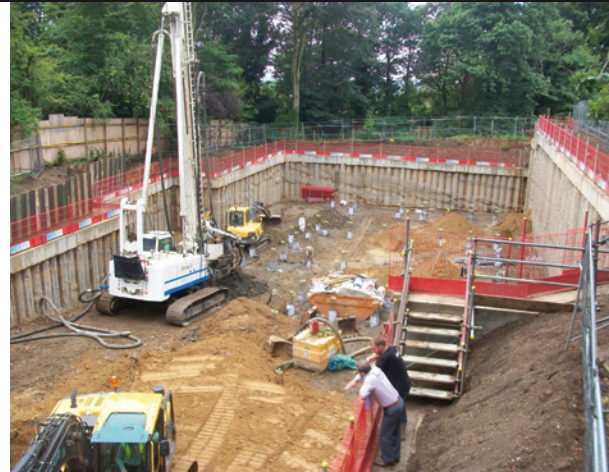
The initial dig stage of this large scale basement project

Concrete supplied by: Procon Readymix www.proconreadymix.co.uk