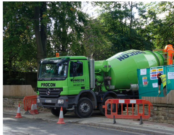
Concrete supplied to site by Procon Readymix

Triton Chemical Manufacturing Co. Ltd. Unit 5, Lyndean Industrial Estate, Abbey Wood, London SE2 9SG