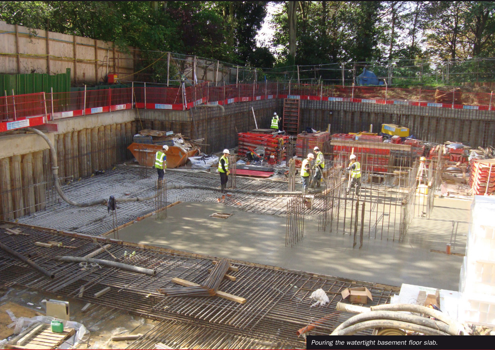
Pouring the watertight basement floor slab.

TT Super Admix (to 450m 3 concrete), TT Waterstop, TT Swellseal Mastic