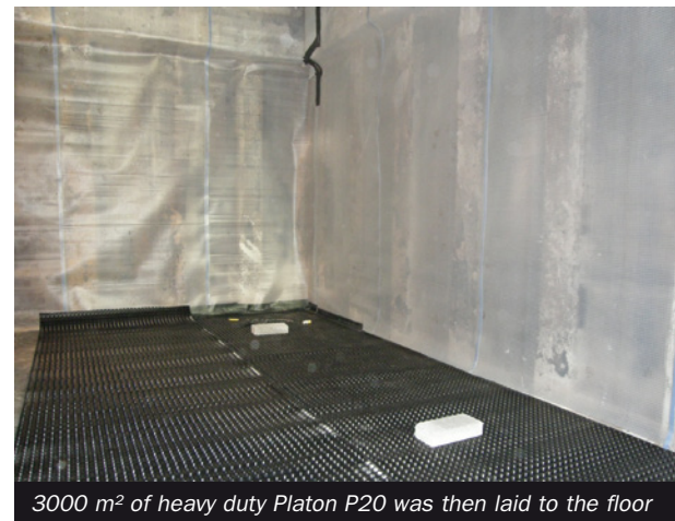
3000 m 2 of heavy duty Platon P20 was then laid to the floor