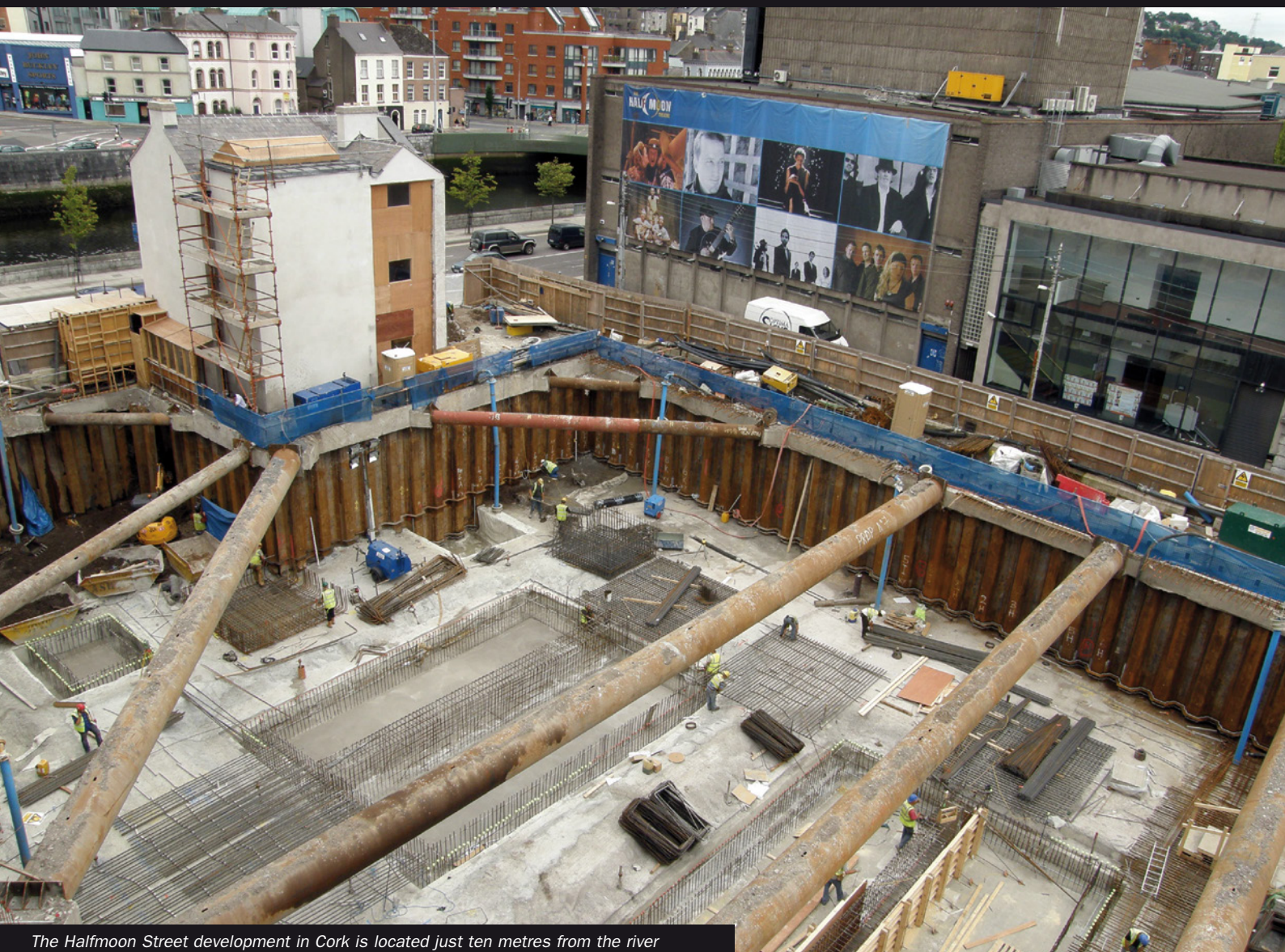
The Halfmoon Street development in Cork is located just ten metres from the river

Platon Multi (210 M), TT Vapour Membrane, Platon P20 Membrane (3000 M 2 )