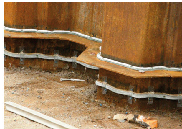
Triton's TT Waterstop and TT Swellmastic to construction joint detailing

The depth of the basement, the high water table and the close proximity of the River Lee (10 metres away) led to a combination of waterproofing systems being specified in view of the intended use of the structure (retail and office space). The combination system (as defined by BS 8102: 2009) comprised a structurally integral type B system (welded sheet piling) on the walls; a drained type C system to walls and floors (a complete internal cavity drain membrane system); and a barrier type A membrane beneath the floor slab.