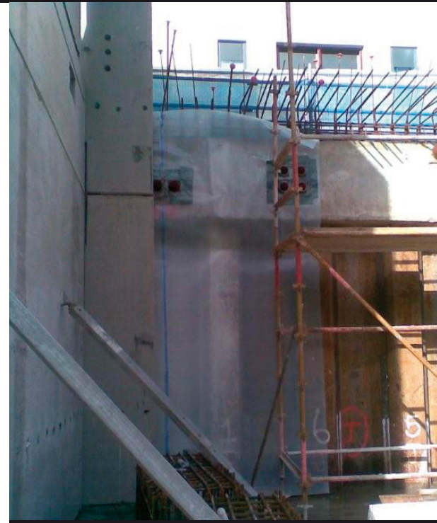
Platon Multi was first fixed to the sheet piling walls

Sheet piling supplied by Sheet Piling UK Tel 01772 79 41 41 www.sheetpilinguk.com