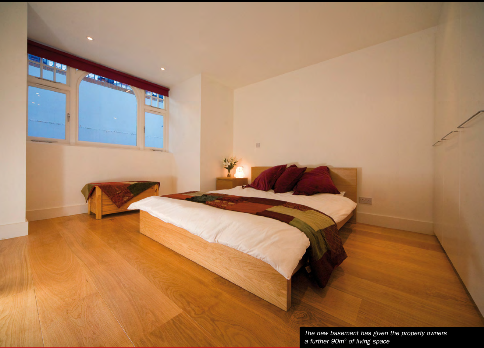
The new basement has given the property owners a further 90m 2 of living space