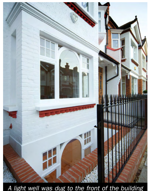
A light well was dug to the front of the building